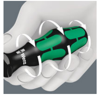
The hard materials used for the handle ensure rapid hand repositioning without any danger of the skin "sticking" to the handle. The surrounding hard zones with large diameters glide like wheels through the hand.