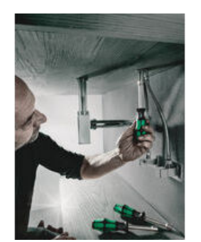
Hollow shaft for protruding threaded rods