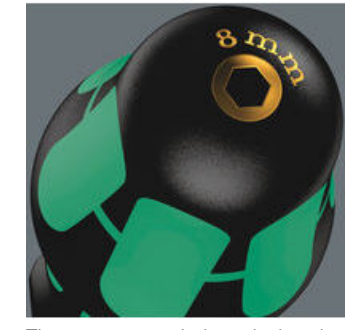
The screw symbol and tip size identification markings on the handle make it easier to find the right screwdriver in the tool case, or at the workplace.