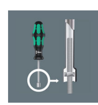
A screwdriver with a hollow shaft is needed whenever there are screwdriving jobs involving threaded rods i.e. the threaded rod through the nut can slip into the hollow shaft of the screwdriver.