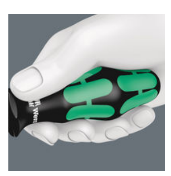
The large contact area - with particularly high friction to the soft zones - results in high torque transfer without any bruising from the edges.