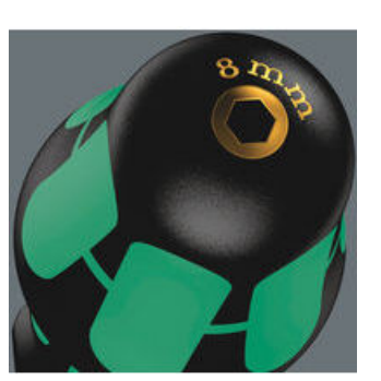
The screw symbol and tip size identification markings on the handle make it easier to find the right screwdriver in the tool case, or at the workplace.

Web link https://products.wera.de/en/screwdrivers_kraftform_plus__series_300_395_ho.html