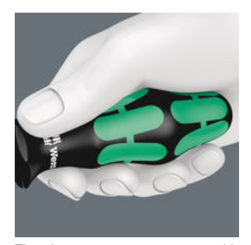
The large contact area - with particularly high friction to the soft zones - results in high torque transfer without any bruising from the edges.