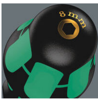
The screw symbol and tip size identification markings on the handle make it easier to find the right screwdriver in the tool case, or at the workplace.