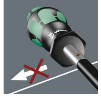
The hexagonal non-roll feature prevents any rolling away at the workplace.