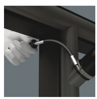
Screwdriving can also be achieved "around the corner" with the screwdriver 392. The flexible shaft unfavourably-positioned allows screw fastenings to be reached. The ideal tool for difficult-toaccess screwdriving applications e.g. in the engine compartment of a car.