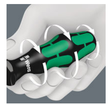
The hard materials used for the handle ensure rapid hand repositioning without any danger of the skin "sticking" to the handle. The surrounding hard zones with large diameters glide like wheels through the hand.