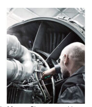
Kraftform Plus screwdrivers ergonomics you can grasp. They relieve the entire hand-arm system even when used intensively. Along with other technical and product advantages such as the Lasertip for a secure fit in the screw head, Kraftform screwdrivers are the ideal choice whenever manual screwdriving jobs are concerned.