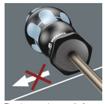
The hexagonal non-roll feature prevents any rolling away at the workplace.