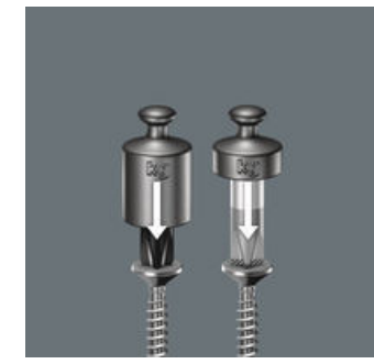
A precisely-focused laser creates a sharp-edged surface structure. Wera Lasertip "bites" itself into the screw head and prevents any slips out of the recess. It is available for screwdrivers for slotted, Phillips and Pozidriv screws.