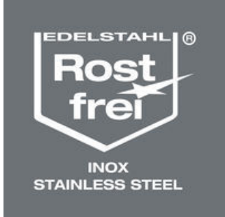
Solution to the rust problem: screwdriving stainless steel together with stainless steel! Wera stainless steel tools are manufactured out of stainless steel so unsightly rust can be avoided.

Screw stainless steel together with stainless steel!