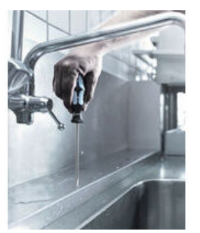
Screw stainless steel together with stainless steel!