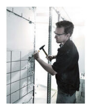
Screwdrivers are often misused as chisels. This can be dangerous. The chiseldriver is the solution when not only screwdriving is required. For fastening, chiselling and loosening seized screws. Wera chiseldriver: the screwdriver whenever the going gets tough!