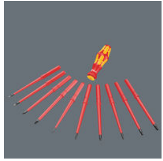
The handle/interchangeable blade system allows rapid exchange of the blades required for a wide range of applications.