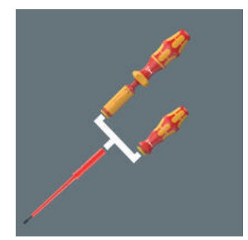
Suitable for Kraftform handles 7400 VDE, 827 T i and 817 VDE .